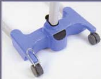
Ergonomic foot pad to assist with initiating movement