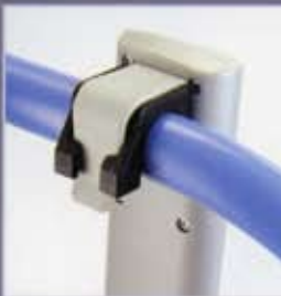
Hand control pads to hold the pendant in place when not in use