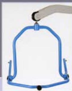
4-Point Positioning Cradle

You can use either the conventional 6-point Hoyer spreader bar or the newly developed 4-point positioning cradle. This choice provides the caregiver with a greater option of slings to use when considering support comfort and flexibility for the resident.