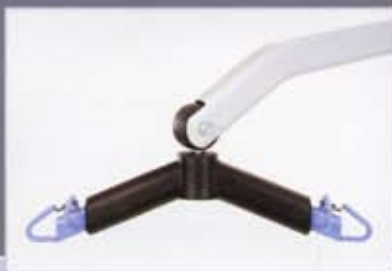
6-Point Spreader Bar