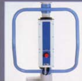
Ergonomic oversized push handle for increased control